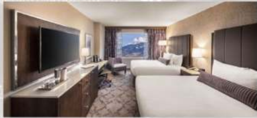
Silver Legacy- Double Queen Room