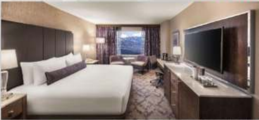
Silver Legacy- King Room