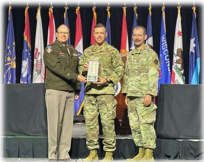
The National Guard Association of North Dakota received its fifth consecutive 100% Membership Award in August at the NGAUS Conference in Milwaukee, Wisconsin.