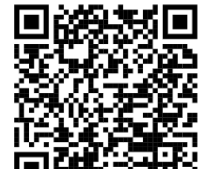
NGAUS 2026 Details

6th Annual Roughrider Golf Tournament: Friday, 18 September 2026 at Hawktree Golf Course in Bismarck