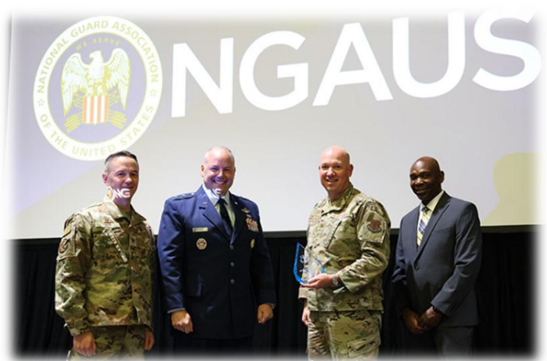
The 119th Wing received the Maj. Gen. John J. Pesch Safety Trophy in 2025. It is presented annually to two flying units judged to have demonstrated the highest standards of flight safety.